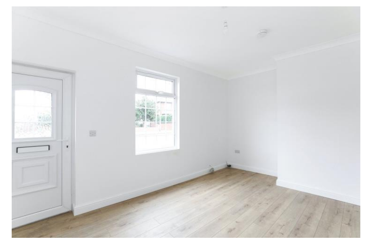
For additional information and full photo gallery please visit www.holroydmiller.co.uk