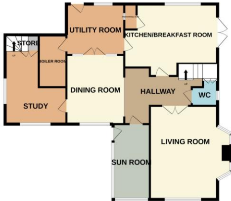
GROUND FLOOR 1641 sq.ft. (152.4 sq.m.) approx.