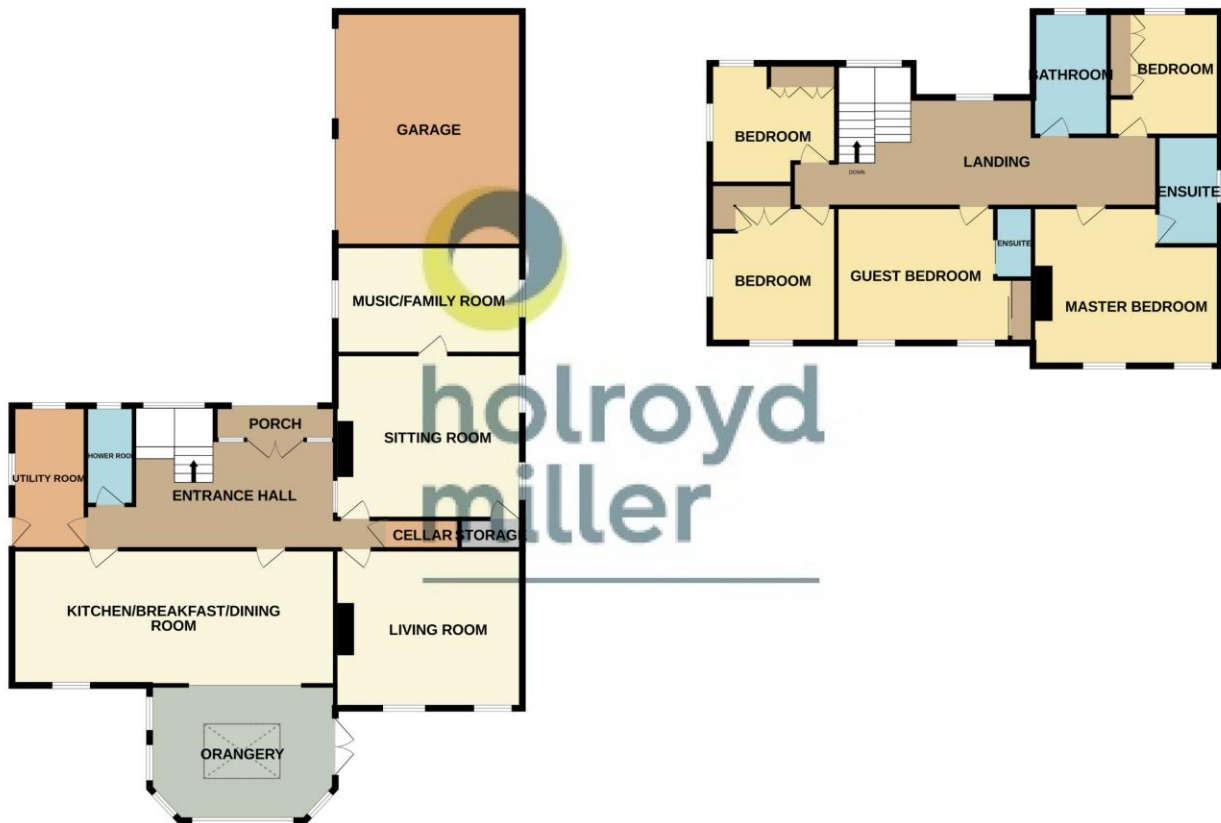
1ST FLOOR 1162 sq.ft. (108.0 sq.m.) approx.

TOTAL FLOOR AREA : 3025 sq.ft. (281.1 sq.m.) approx.